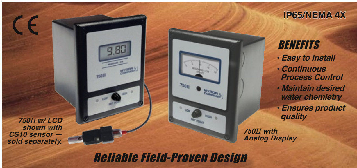
750II w/ LCD shown with CS10 sensor — sold separately.