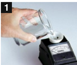
Rinse and fill cell cup