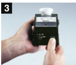
Push button to indicate reading