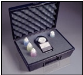
Porta-Kit with EP11/PH

All Myron L instruments are factory calibrated with Standard Solutions of known conductivity/TDS values and (when appropriate) with pH buffer values 4, 7 and 10. These solutions and buffers are traceable to the U.S. Government's National Institute of Standards and Technology.