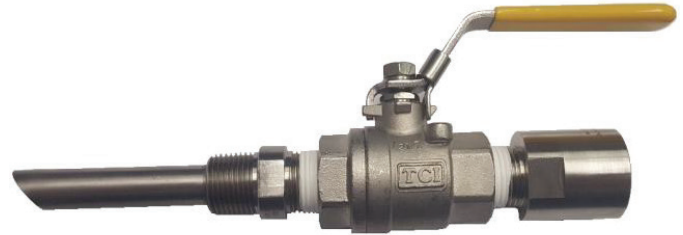
Depicted: QCC Series, 1/2" Injection Quill Assembly, 1/2" NPT, Type 316 SS