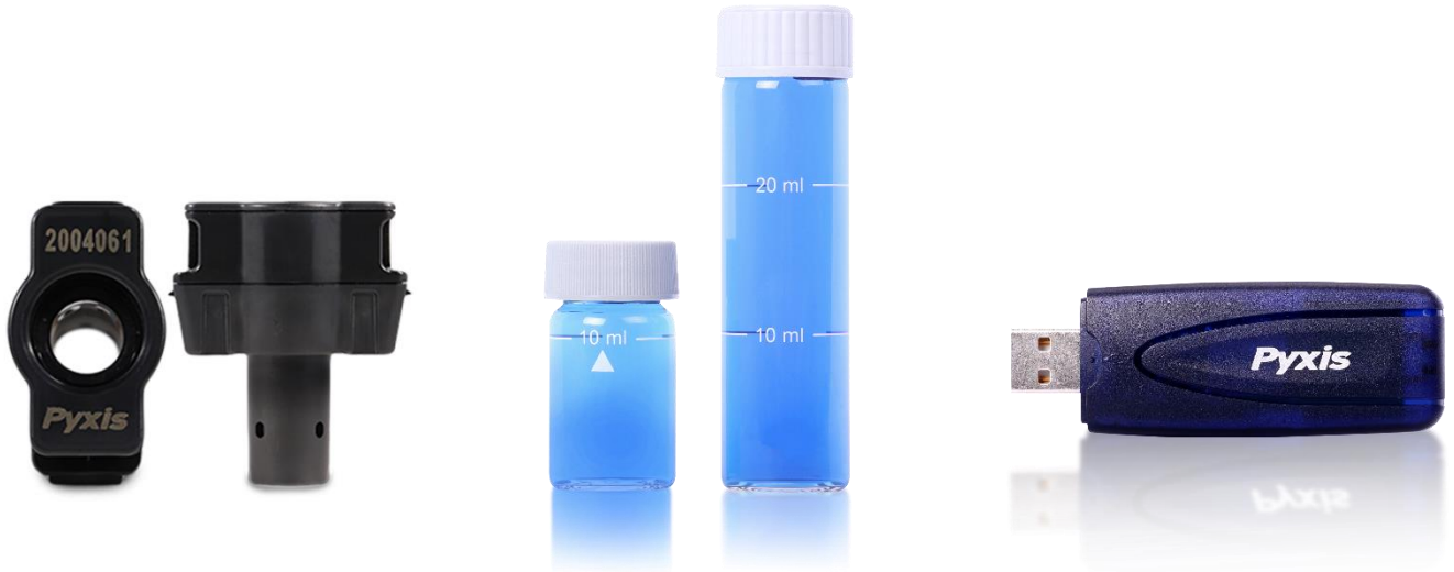
16mm COD Adapter

Each SP-910 comes equipped with one set of MA-24 (10mL) and MA-25 (25mL) sample vials, one 16-mm COD Vial Adapter (P/N 52214) and one MA-NEB Bluetooth USB Adapter.